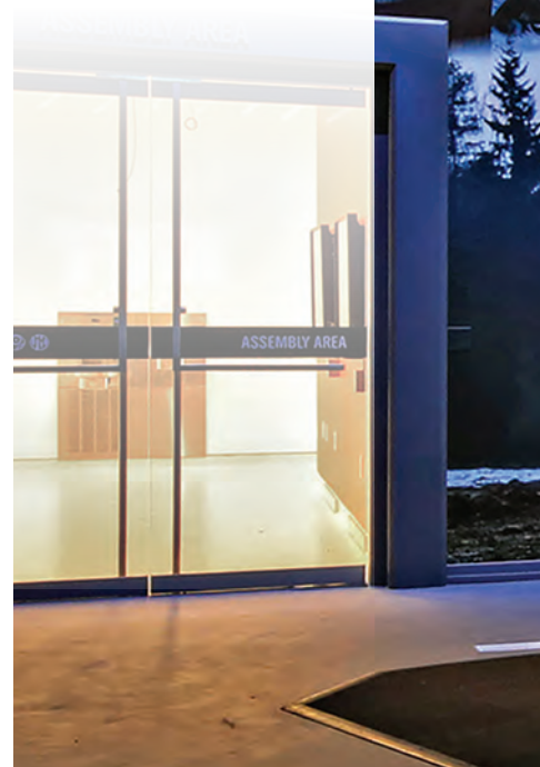
The front entrance of the National Museum of the United States Army.

Brave brigades have conducted countless missions in the areas of exploration and discovery, science and technology, communications and cooperation along with recovery and disaster relief. The ingenuity of American soldiers has greatly aided the nation's progress and prosperity for more than 240 years.