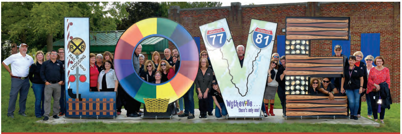
LOVE sign in Wytheville

center. Home to The Crooked Road: Virginia's Heritage Music Trail and the starting point for exploring that heritage, exhibits tell the story of how this roots music was born in the area and still flourishes. Regular concerts in the performance area provide both entertainment and an opportunity to talk with musicians.