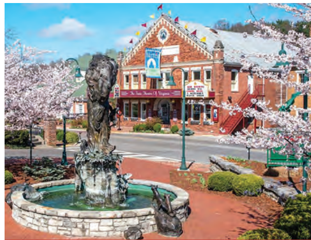
Fountain outside the Barter Theatre