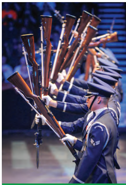
United States Air Force drill team

Norfolk State University Theatre Company. The fest will also feature presenting dance groups like Les Ballets Trockadero de Monte Carlo and Collage Dance Collective . Another significant musical performance is the Violins of Hope , a chamber concert played on violins that have been recovered and restored from the Holocaust. The concert will be a tribute to those who lost their lives to the devastation of the holocaust, a timely performance as the 75th anniversary of World War II approaches.