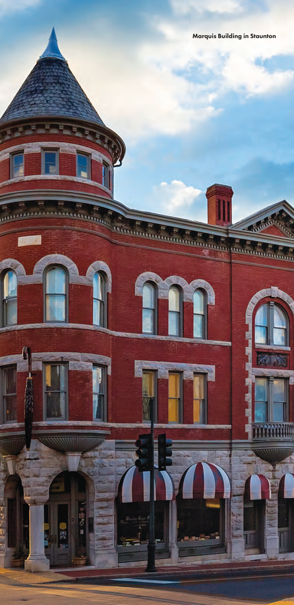
Marquis Building in Staunton