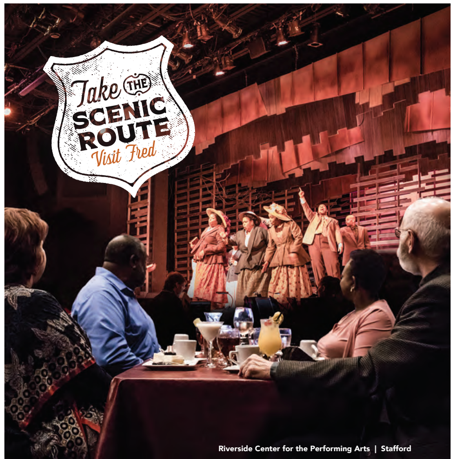
Riverside Center for the Performing Arts | Stafford

10. There are candles in the windows and carolers on the streets during the holidays at Colonial Williamsburg . And great shopping, too. With tradespeople, on Merchant's Square and off-site. ( colonialwilliamsburg.com ) ■