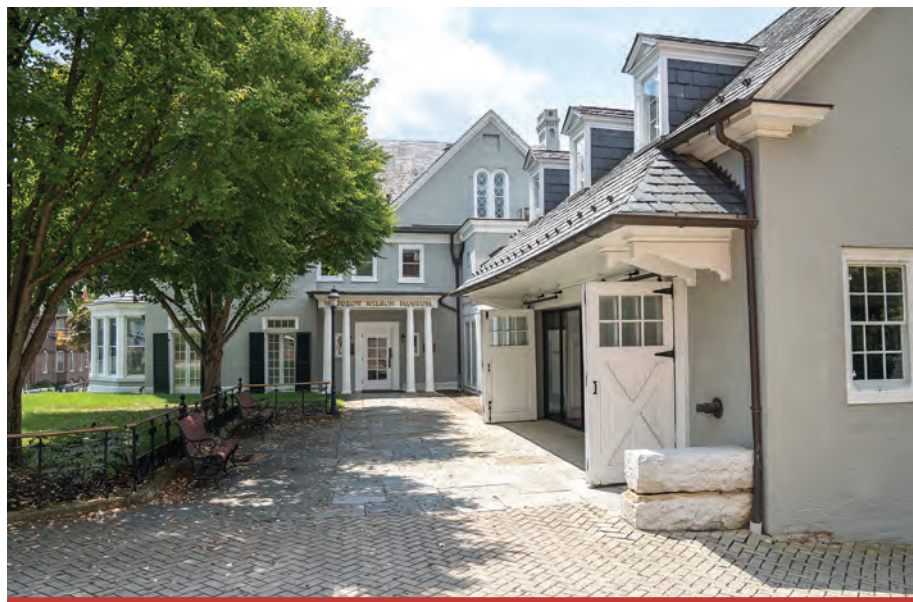
Woodrow Wilson Museum in Staunton

The Heifetz International Music Festival attracts gifted violin, viola and