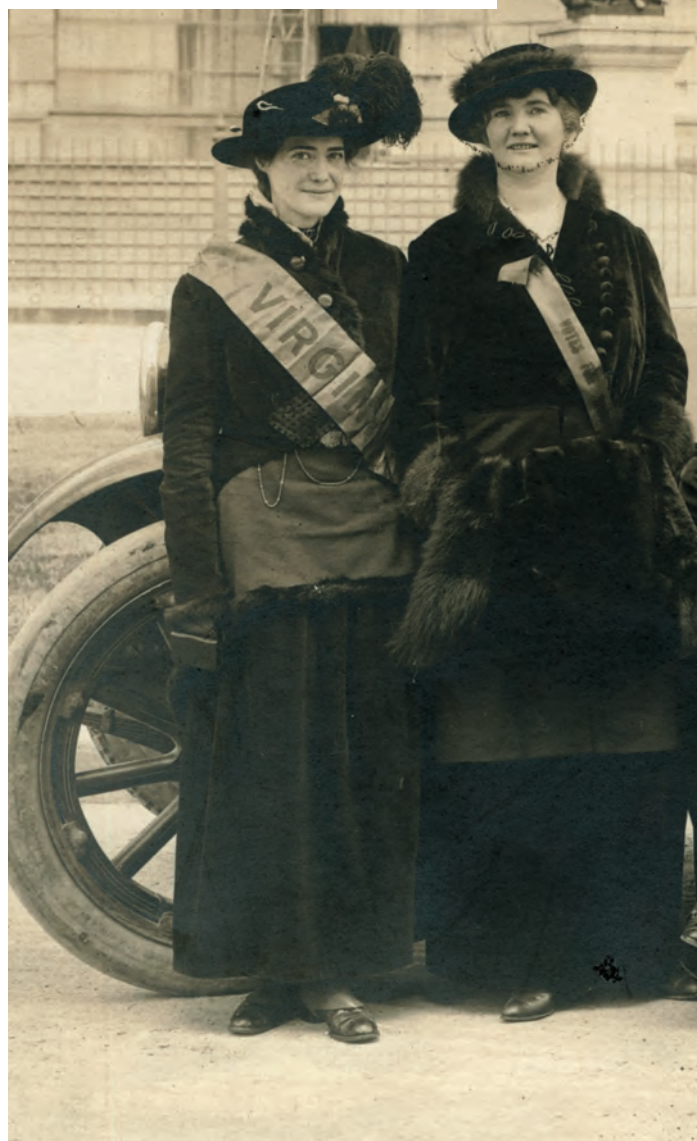
Virginia Museum of History & Culture

The Lucy Burns Museum in Lorton focuses on commemorating the party's efforts in obtaining women's right to vote. The museum tells the story of the suffragists who were arrested for courageously picketing the White House in 1917. The museum also aims to engage visitors in the history of the Lorton Correctional Facilities that operated from 1910-2001, founded by President Roosevelt during the era of progressive reform but was later repurposed for a growing arts center.