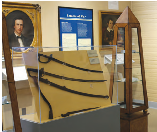
Thomas J. Boyd Museum