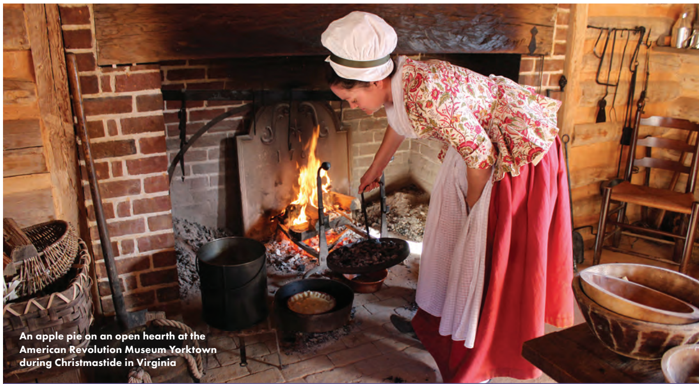
An apple pie on an open hearth at the American Revolution Museum Yorktown during Christmastide in Virginia