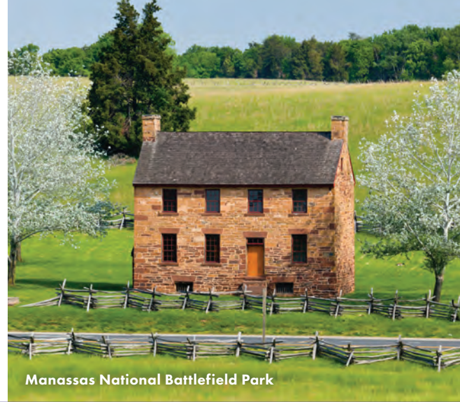
Manassas National Battlefield Park

This itinerary blends a tribute to our military heroes and a critical American Civil War battlefield with delicious food, craft beers, wine and local shopping. The result is a masterful experience for groups in Prince William Virginia's charming towns.