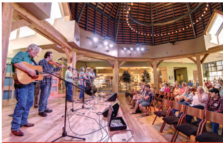
Musicians perform at the Southwest Virginia Cultural Center in Abingdon.

The perfect first stop for an understanding of exactly where you are is Southwest Virginia's Cultural Center & Marketplace . The area has a rich musical heritage and it's on full display at the